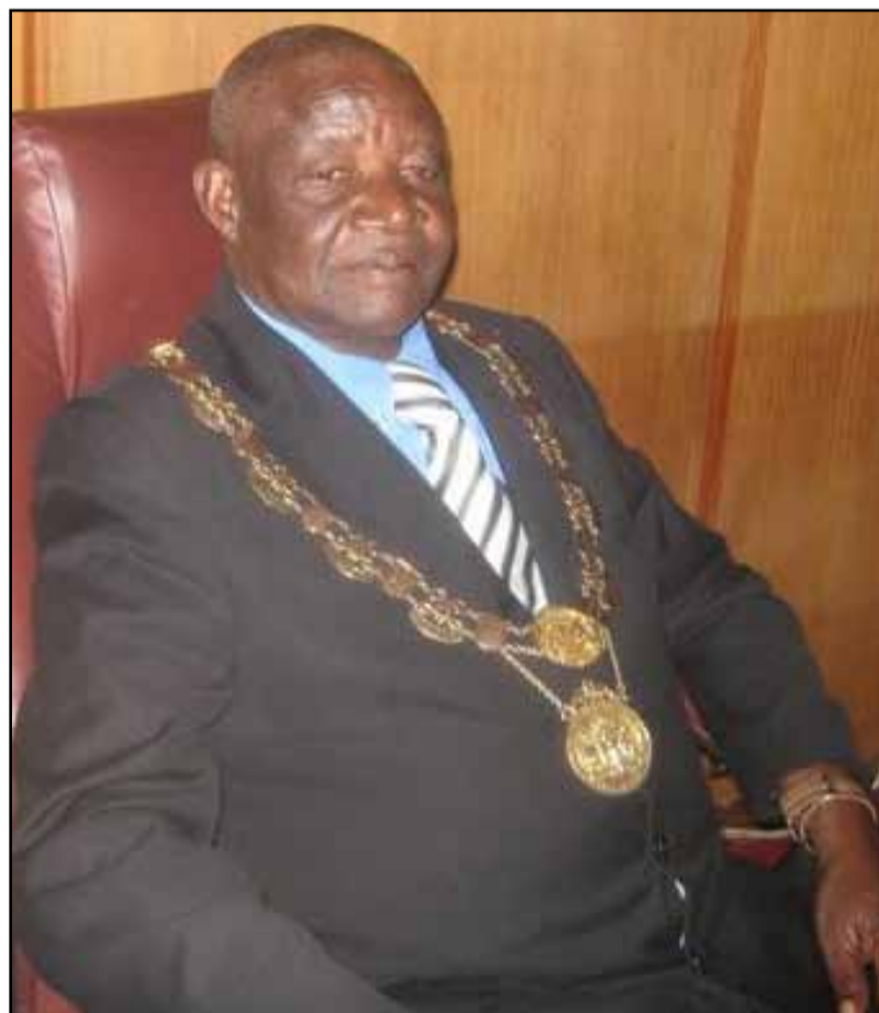
Kwekwe mayor, Shepherd Tobaiwa

“However, despite these hurdles, we aim to improve the quality of life for all Kwekwe residents through the provision of health, safe and clean water, road maintenance and education,” said Clr Tobaiwa.