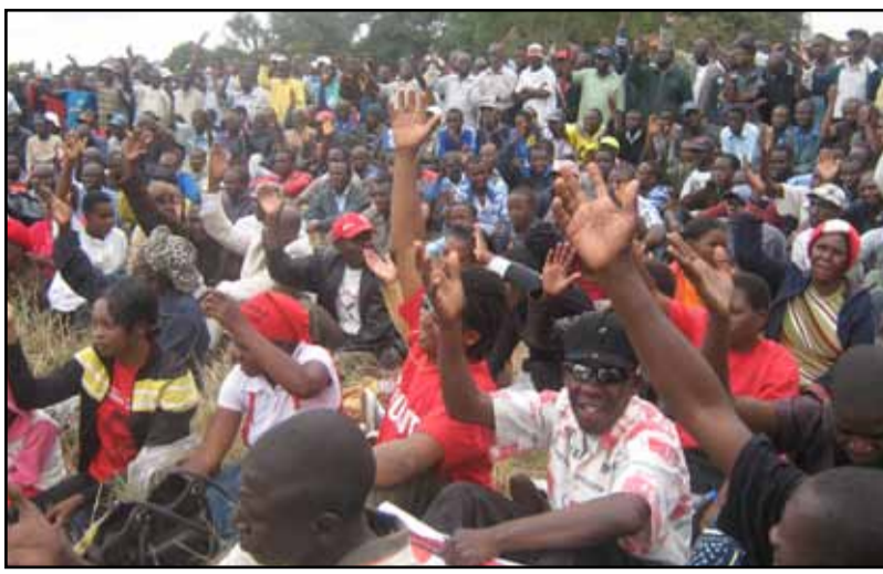
Part of the bumper crowd that attended the Kuwadzana rally

Also present at the rally was the Youth Assembly chairperson and Nkulumane MP, Hon. Thamsanqa