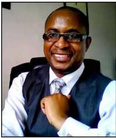
Senator Obert Gutu

No amount of propaganda can wash away the fact that the MDC, under the leadership of Morgan Richard